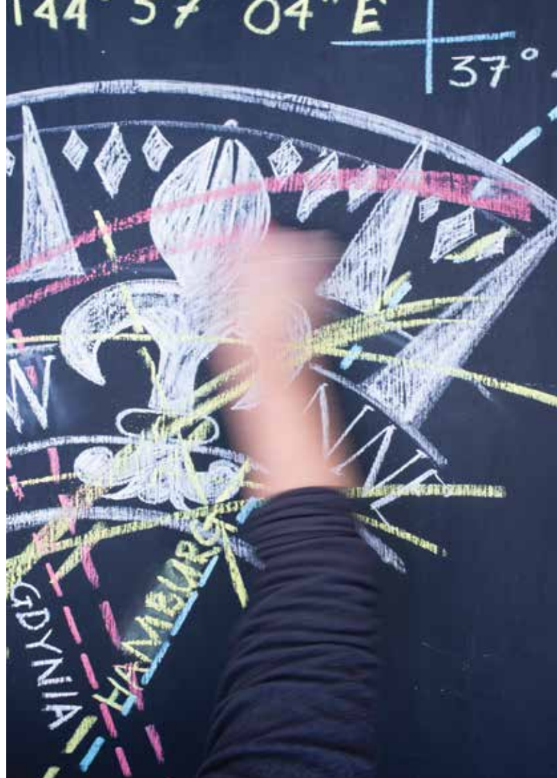
Floor chalk drawing (2015). (Detail). >

The Sea is All Around Us is an installation inviting seafarers and visitors to participate in a global project which aims to map the mobile life of seafaring souvenirs. For a fortnight in May 2015, visiting seafarers activate a chalk drawn compass on the circular floor of the Dome Gallery at The Mission to Seafarers Victoria in Flinders Street, Melbourne, marking the intersection of its latitude and longitude (37° 49'21" S 144° 57'03"E). Over these two weeks the Dome Gallery will be inscribed with marks mapping the multifarious journeys made by seafarers, recording destination and departure ports, homelands and waterways, and in doing so will make visible a small segment of the global patterns of seafaring. Custom-made souvenirs designed for the installation are gifted to seafarers as gestures of welcome and receptacles for future memories. I design these souvenirs in Australia and have them manufactured in Poland so they can continue their journey by sea, to destinations far beyond the Dome. Each of the limited edition enamelware mugs, postcards and catalogues imprinted with a QR code become trackable, mobile objects. Like messages in bottles these souvenirs will leave our shores, as ambassadors, carrying with them memories of the Norla Dome, the waters